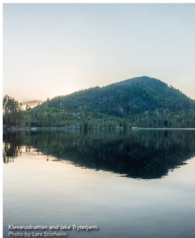
Klevrudnatten and lake Trytetjern.

Back at Trytetjern, you can take a swim from the small beach in the north eastern corner of the lake. There is also a trail going around the lake, and a nice open shelter in the southern end of the lake.